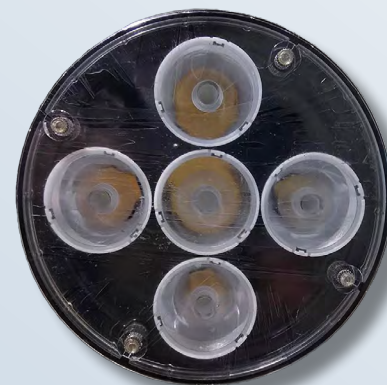
PowerRail Part# SLS-PAR46