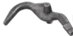
F31A Knuckle Thrower