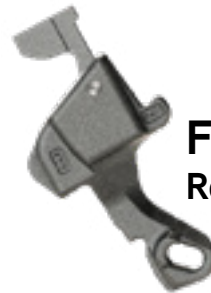
F400AE Rotary Lock