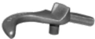
E30A Knuckle Thrower