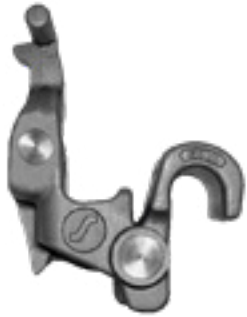
E24B Lock-Lift Assembly, Single