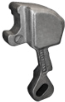
E42BE Reduced Slack Lock