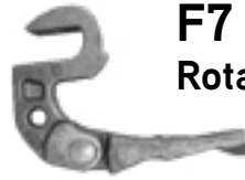
F7 Rotary Lock-Lift Assembly